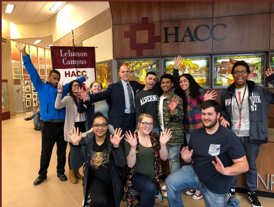
I engaged students while visiting the Lebanon Campus.

“The Four: The Hidden DNA of Amazon, Apple, Facebook, and Google” by Scott Galloway