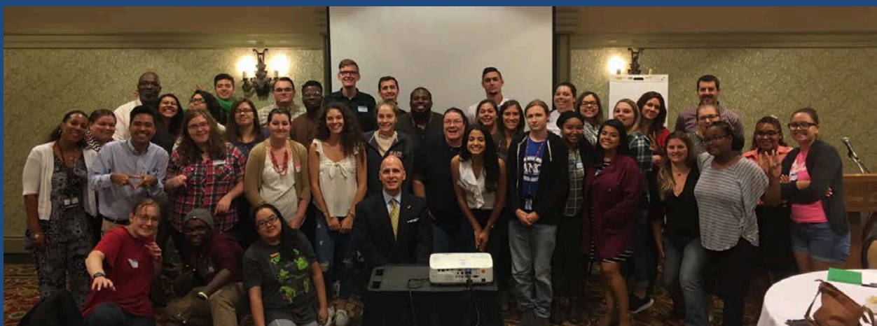
Student leadership retreat in Lancaster. "A lot of different flowers make a bouquet." - Muslim origin

Over the next several weeks, I will continue to keep you updated on any progress we make.