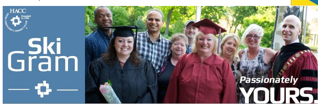
March 2, 2017

In my 65<sup>th</sup> Ski Gram, I am happy to share the following, and even more news: