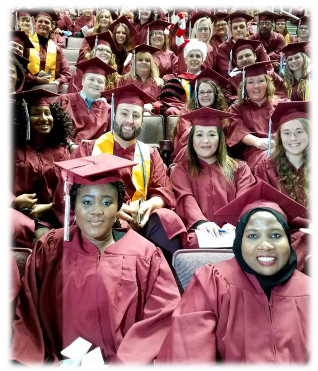
If you have ever wondered what student success feels like, just look at the faces of these members of the HACC Class of 2016 preparing to graduate on Tuesday, Dec. 13, 2016. I was proud to share in the celebration!

Our Lancaster Campus is most proud of a unique new mentoring program: