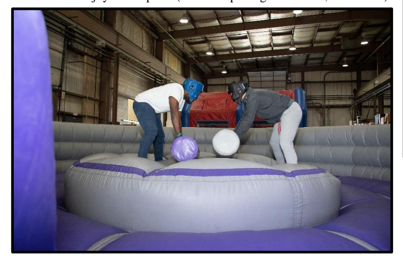
Above: A little jousting among friends; Right: Students design their own personalized signs; Below: LIGHT Club photo booth fun