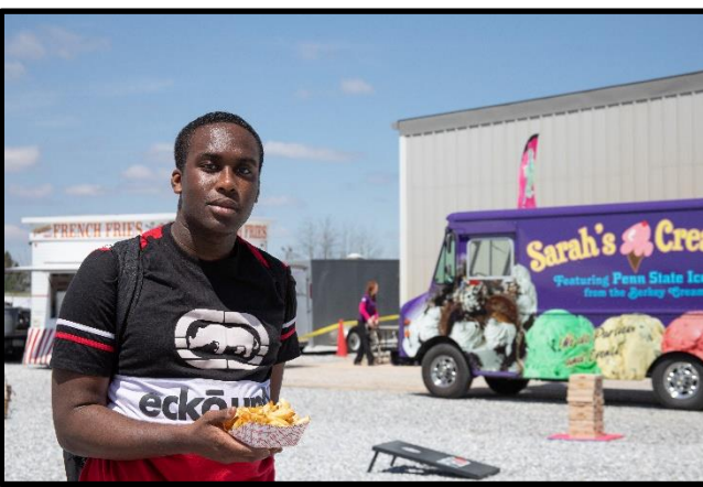
Above: So much food! French fries, ice cream, toasted cheese sandwiches, hot dogs (even vegan), and more!