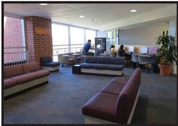
Student Lounge Area - Third Floor - East Bldg

As a result of a request from students, along with input from faculty, we transformed the 3rd floor lobby computer kiosks into a new student lounge.