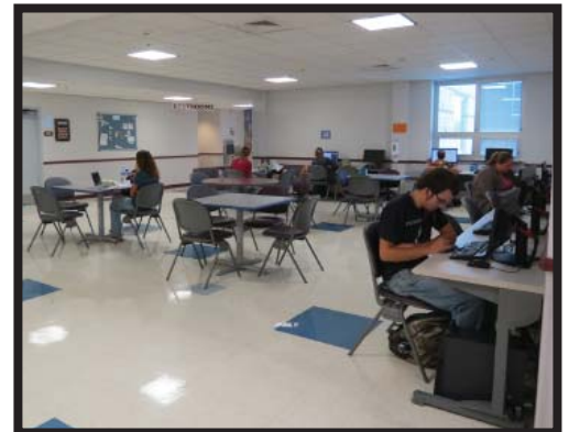
Computer Area - Third Floor - East Bldg