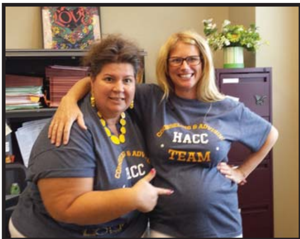
Counseling and Advising team show their HACC spirit