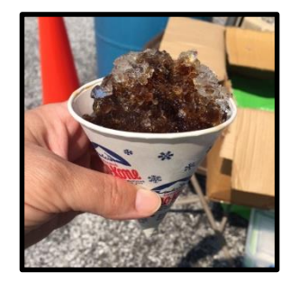
Free snowcones on a hot day

On September 1, 2015, HACC York celebrated HACC Fest 2015. Many students, staff and faculty members came out to learn about clubs, organizations, and many other opportunities. They also enjoyed free food, lots of giveaways, and the opportunity to play "Name That Tune".