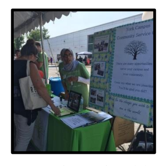
Community Service Club