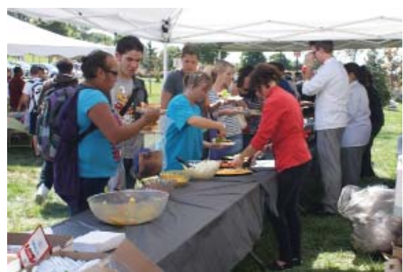
Wonderful food and great service