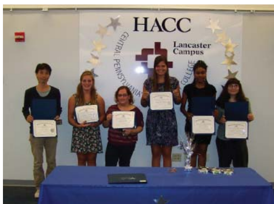
Shooting Stars Honorees