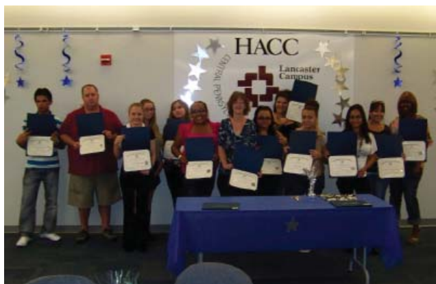
Rising Stars Honorees

Rising and Shooting Stars of the Lancaster Campus were honored in a ceremony on September 20. The honorees are high-performing students in developmental coursework, particularly reading.