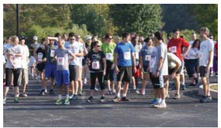
Getting ready for the race to begin