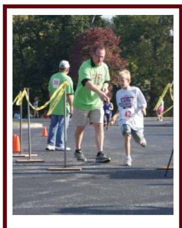
5K Run - fun for all ages