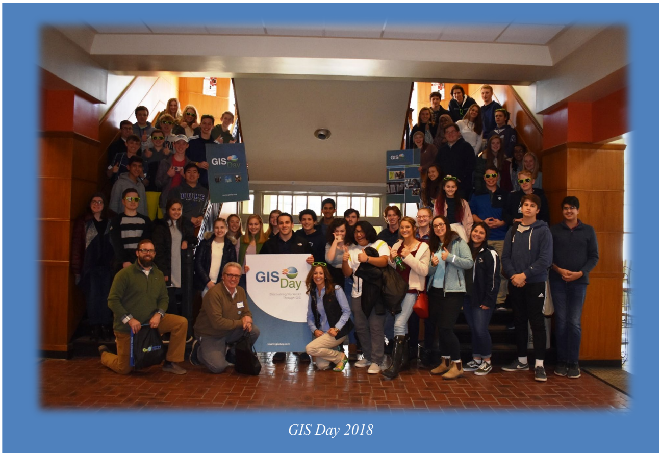
GIS Day 2018