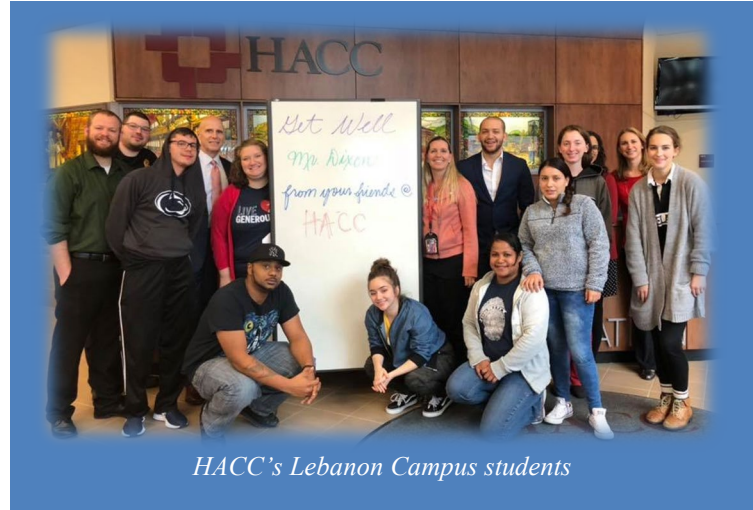
HACC's Lebanon Campus students