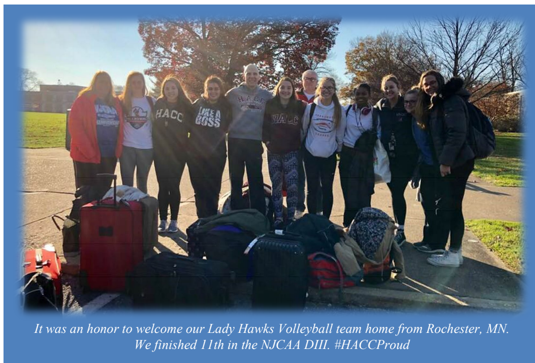
It was an honor to welcome our Lady Hawks Volleyball team home from Rochester, MN. We finished 11th in the NJCAA DIII. #HACCProud