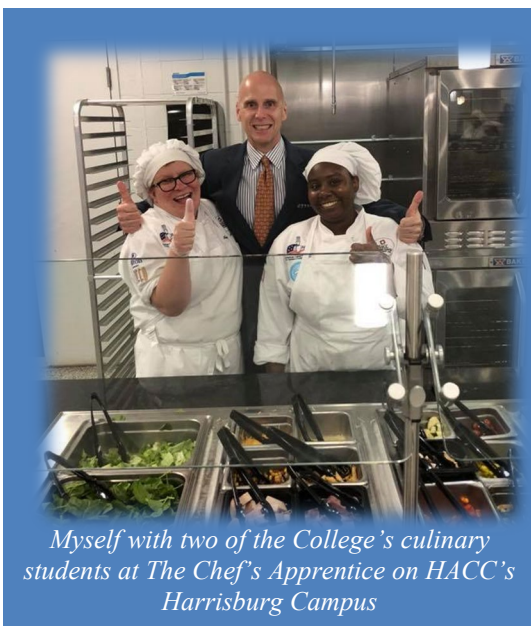
Myself with two of the College's culinary students at The Chef's Apprentice on HACC's Harrisburg Campus