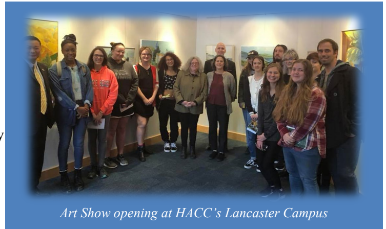
Art Show opening at HACC's Lancaster Campus

For additional information on all 83 objectives, I invite you to view the complete status report .