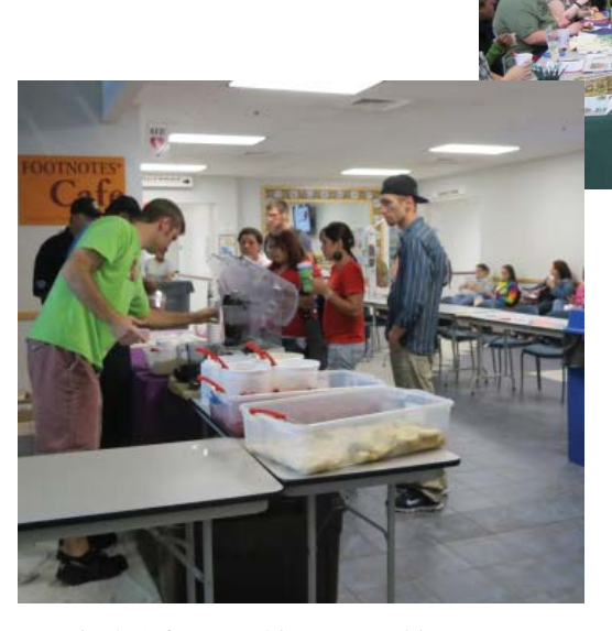
Tropical Cafe smoothies were a hit!