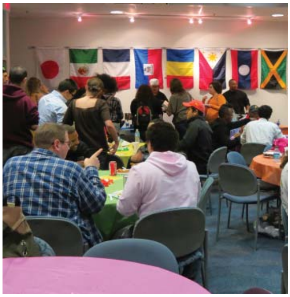
Students enjoy the ethnic food choices