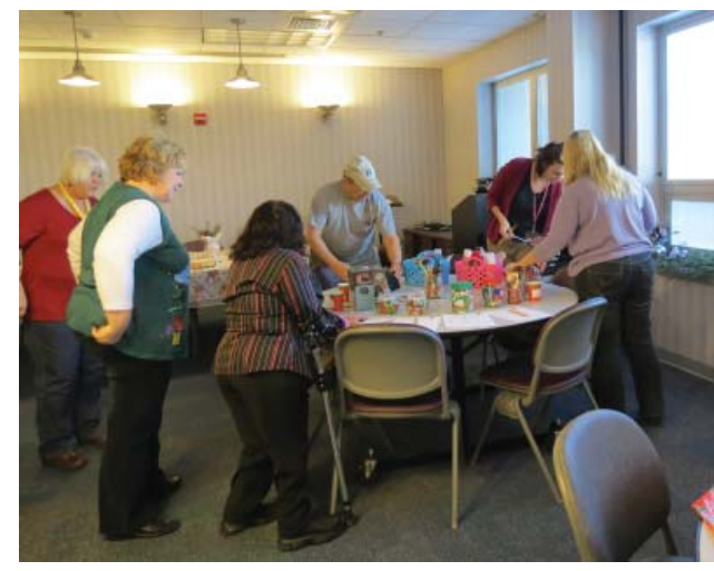
Picking where to put the door prize ticket.