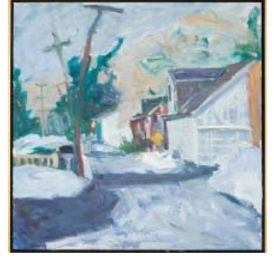
Ruth Bernard painting

Spring Art Faculty Show January 14 - February 14, 2013 Art Space - East Building - Lancaster Campus