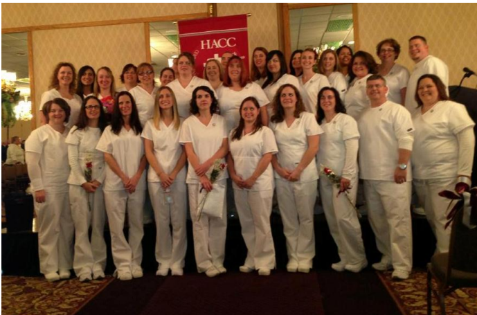
CLASS OF 2012

Several students were also recognized for their community service, through their participation in the Nursing Student Organization throughout their student nurse career.