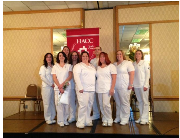
2012 AWARD WINNERS