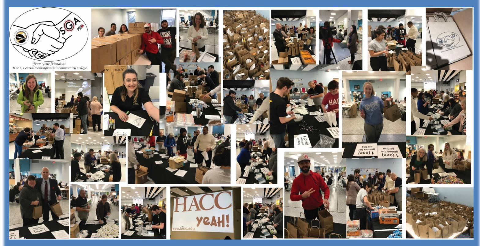
With help from students, staff, and faculty, 700 "Care Kits" were assembled for students at Butte College in Oroville, California who were impacted by the devastating camp fire this past November