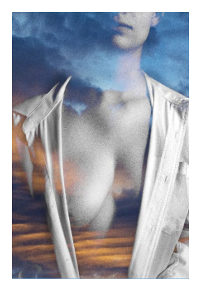
By Brittany Oliver

Our HACC students invite you to support their passion as they display their photography at HACC's student honors exhibit!