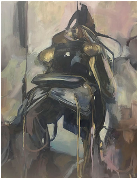
Exhibit Opens Feb. 26, 2018

The professional artists who comprise the full- and part-time faculty of the Art Department at HACC, Central Pennsylvania's Community College, will exhibit their work Feb. 26-March 23 in the Rose Lehrman Art Gallery at the Harrisburg Campus.