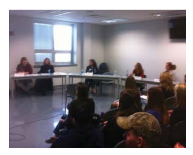
Panel members answer student questions

It was a valuable learning experience for everyone who attended.