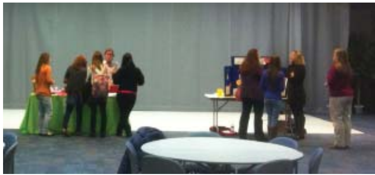
HACC students visit display areas of early childhood education panelists