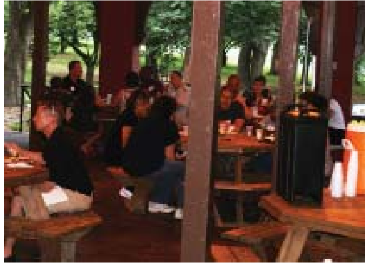
In spite of threatening weather, about 70 people attended the second annual HACC picnic