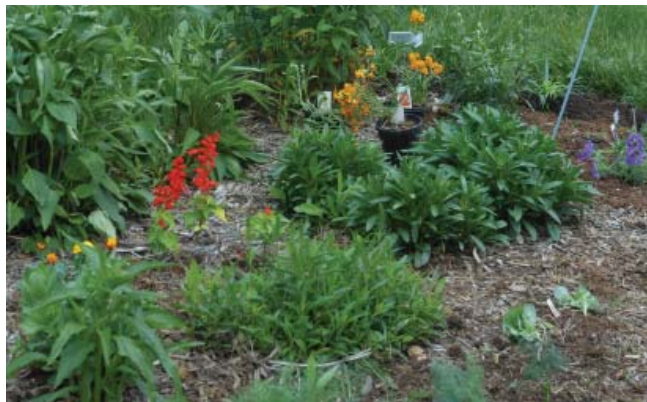
New perennials in the butterfly garden