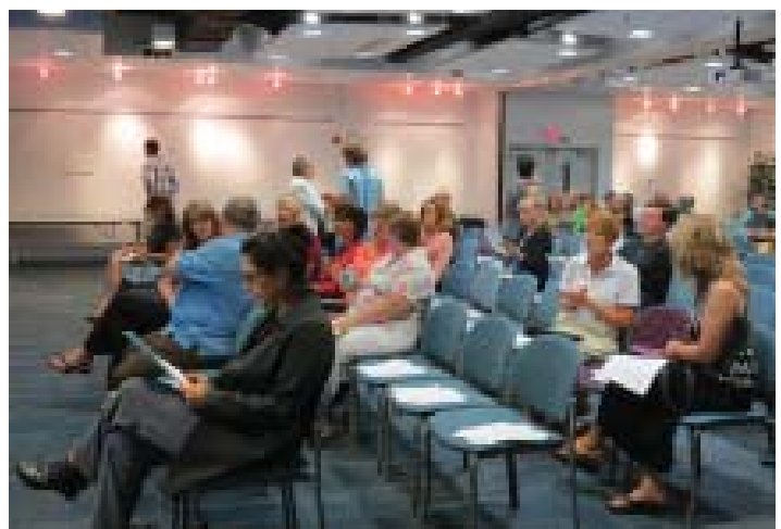
Faculty attending the inservice

Just a reminder that any faculty using material from her presentation should provide the appropriate citation.