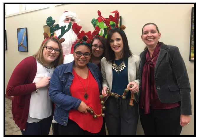
Here Comes Santa Claus

Twas the night before finals... and all through the campus, we were busy keeping spirits high and stress low! In an attempt to quell nerves and exhaustion, the Student Development and Multicultural Programs department hosted daily events for students studying hard at the end of the semester.