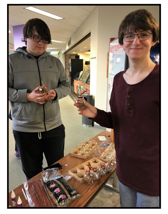
Make & Take an Ornament