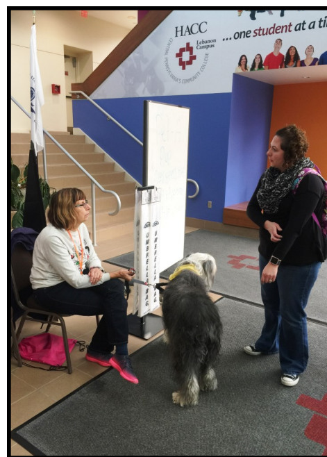
Therapy dogs helped our students to cope with stress during finals week.