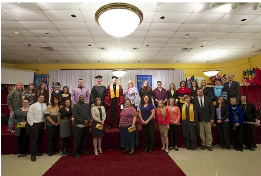
The York campus inductees pose in honor of their accomplishments!