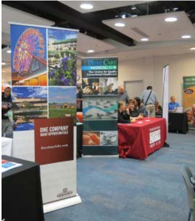
Vendors: Hershey Entertainment, Prime Care and School District of Lancaster