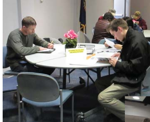
Table provided for applications and surveys