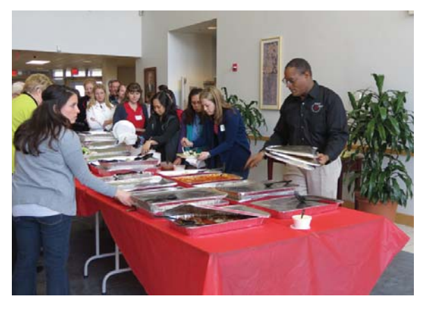
Time for lunch