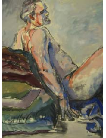
"Daydreaming Grga" Acrylic on paper

Artist: Ellen Slupe, work in Acrylic on paper, and collages Title of show: "Uncovered" April 1 - May 8, 2013 Reception: Tuesday, April 9, 5:00 - 7:00 pm Location: Art Space, East Building, Lancaster Campus-HACC