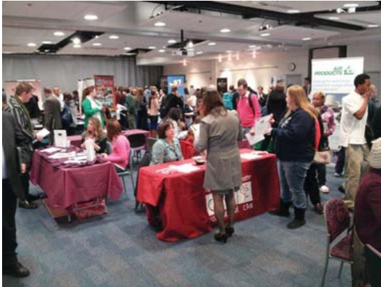
A busy and successful 2013 job fair

Thanks to the work of many who helped to ensure the success of this event; we were able to connect many students, alumni and community job seekers with employers. Many job seekers indicated to us verbally and on their evaluation forms that they were able to leave resumes and/or were encouraged to apply online for others and employers shared that we were able to help meet their hiring needs. Many employers indicated they would be following up with several potential candidates for on-site interviews. It was a very positive event overall.