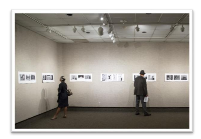
Exhibit dates: Nov. 19-Dec. 6, 2018 Reception: Dec. 6 from 5:30-7 p.m.

The exhibit will showcase over 50 photographs by current students. The collection covers a variety of subjects, including landscapes, portraits, still lifes, nudes and architecture.