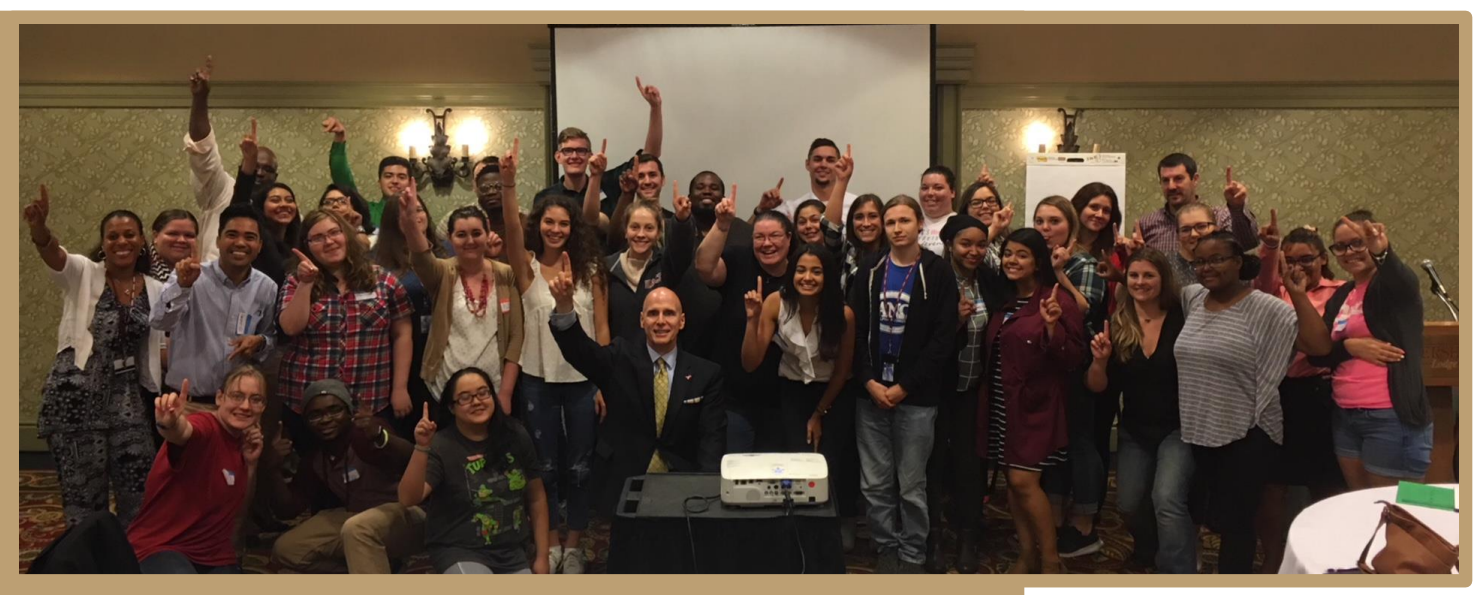
I visited with HACC's student leaders when they gathered in Hershey for a retreat.

If you have any questions, please email <u>oca@hacc.edu</u>.