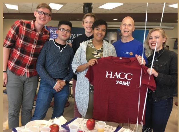
Student Government Association leaders from the Harrisburg Campus joined me at a Rotary breakfast held at Harrisburg High School.

Temperature set points are established for every building on each campus. During winter, the temperature is set to 70 degrees. There is a plus or minus two (2) degree variance that is acceptable as monitored by the Facilities Maintenance Department (FMD). The College considers this an adequate comfort level. However, the Heating, Ventilation and Air Conditioning (HVAC) system works by area zones throughout each building and within a given zone, there may be some variance in temperature.