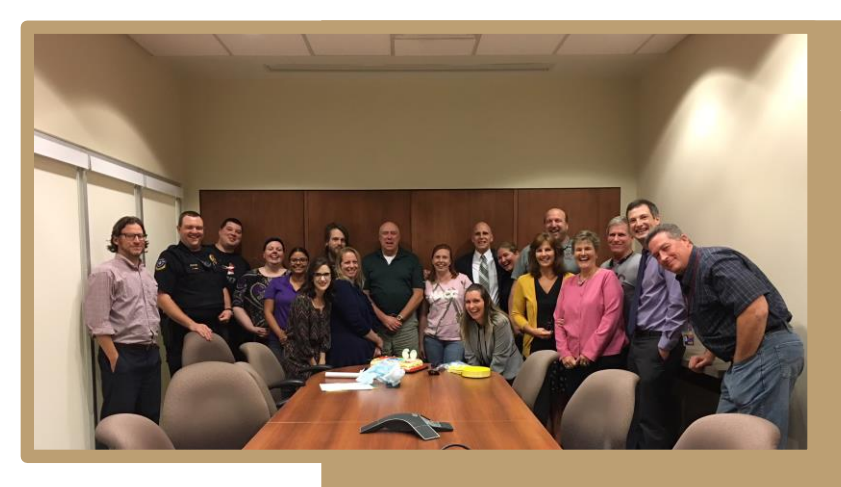
Celebrating Lebanon Campus employees recently.