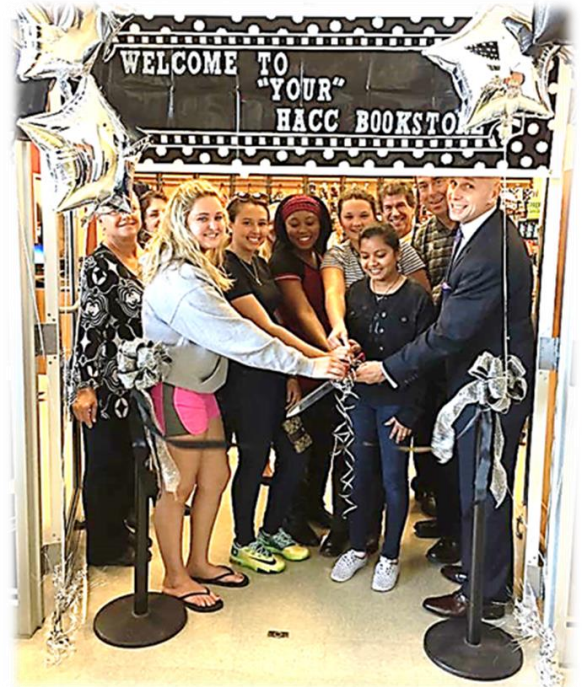
Students and staff members gather to celebrate the grand opening of the "new" York Bookstore on Wednesday, Oct. 5, 2016.

Please keep in mind that this tool is a guide to what we may accept. Actual credit will not be awarded until (See TRANSFER on next page)