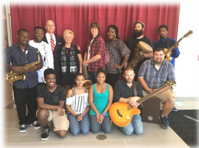
Our students have many talents, and I look forward to hearing more from the members of our Music Club, whom I greeted on a recent walk around the Harrisburg Campus.

When you receive email inquiries related to Right to Know or Freedom of Information Act requests, please do the following: