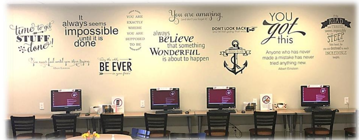
Encouraging words for student writers in the York Campus Writing Center.

medical issue. The York team rallied around to provide his family with support, hope and encouragement. The Campus also held several fundraising events to benefit his family.