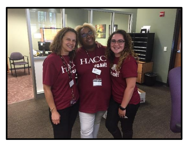
Above: Enrollment Services is all smiles!