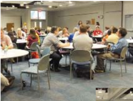
Good time for camaraderie