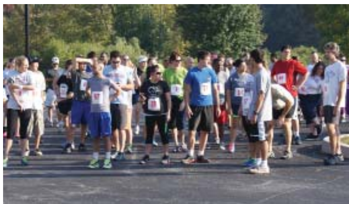
Getting ready for the race to begin