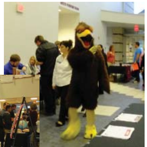
Above: The HACC mascot keeps everyone entertained