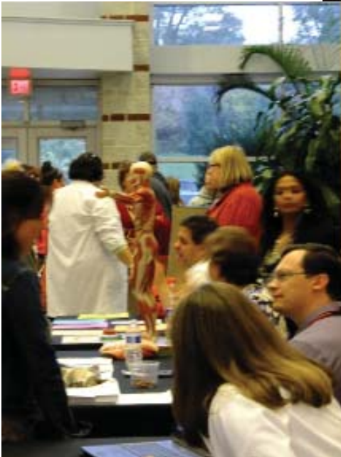
Above/right: HACC faculty meet prospective students