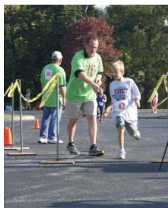
5K Run - fun for all ages