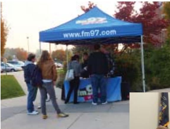
FM97 broadcasts live from the Lancaster Campus