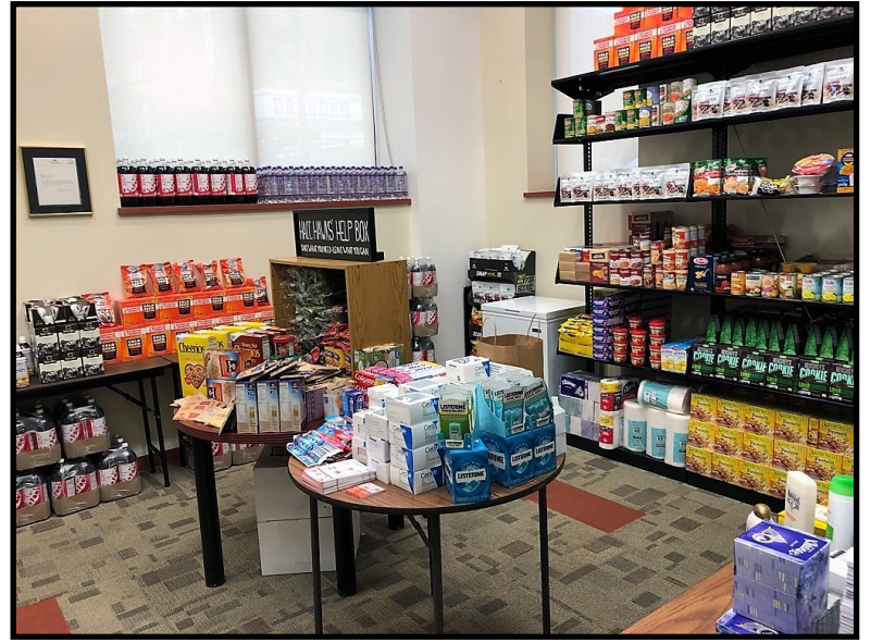
Lebanon Campus Student Pantry

We also have information available to support our students with other needs they may have. If you need a contact to help a student and don't know where to turn, please reach out to campus administration. We will help point you in the right direction.