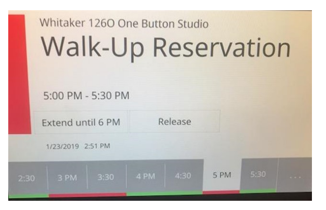
Dec. 2018/Jan. 2019