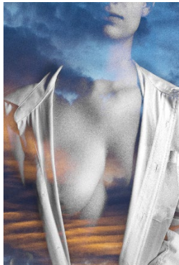
By Brittany Oliver

Our HACC students invite you to support their passion as they display their photography at HACC's student honors exhibit!