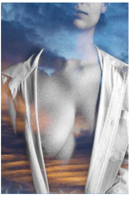
By Brittany Oliver

Our HACC students invite you to support their passion as they display their photography at HACC's student honors exhibit!